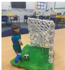
Windmill Primary School

KS2 1 st place: Chadsmead Primary School