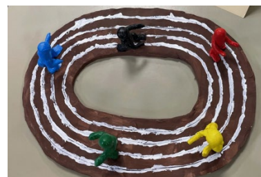
Chadsmead Primary Academy