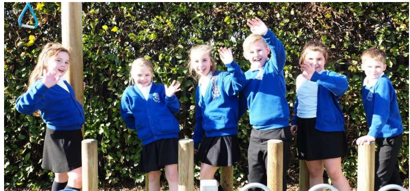
A school built on "Consideration and Respect"

10 years ago in November 2012 Birchwood Primary, along with The Polesworth School and Dordon Primary, converted to academy status and the Community Academies Trust was born. 10 years on, CAT now comprises 18 schools who all value being part of the Trust and working alongside and collaborating with other likeminded schools. Our schools are all at different points along their journey, but we all have so much to offer and so much to learn from each other. Part of our Trust values are that staff all see themselves as learners who are empowered to make decisions, be creative and lead. I believe that this is what makes our Trust unique and why I am proud that Birchwood is a founding member of the Community Academies Trust.