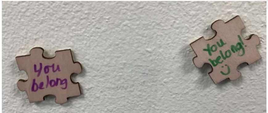
You are an important part of the puzzle.

If you had told me 10 years ago I would be sitting here writing in this role, I would have laughed. For at that time, I was the deputy head of Dordon – a school on the infamous list of the bottom 500 schools in the country, with an academy sponsorship looming on the horizon. At that time, primary academies were rare, in fact I didn't know of any. As you can imagine, the prospect was daunting.